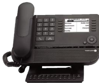
8038 IP / 8039 TDM Premium DeskPhone