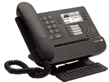
8028 IP / 8029 TDM Premium DeskPhone