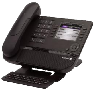
8068 IP Premium DeskPhone

Alcatel-Lucent has extended wideband audio across its Premium DeskPhones, supporting the industry-standard G.722 implementation currently being rolled out by public network service providers. The Premium Deskphones also pair with monaural and binaural headsets supporting wideband audio, noise cancellation and Bluetooth 1.2.